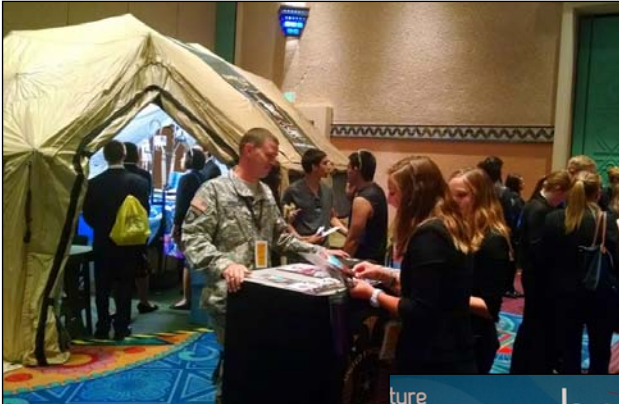
Army booth at Expo