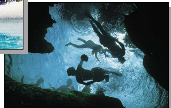
View from below a few snorkelers at Wekiwa Springs.