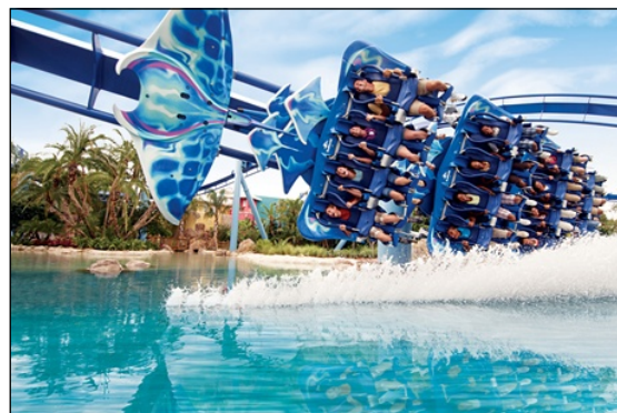
Experience Manta®, a flying roller coaster, and see water creatures up close and personal at SeaWorld®.

During HOSA Day you can explore Central Florida and all it has to offer! There are plenty of things to see that will fit any budget. You can pick one of the bodacious world-class amusement parks like the Magic Kingdom ® and Universal Studios®. Or you might want to get off the beaten path and see attractions like the UCF Arboretum , which covers an area of 32 hectares with 600 plant species and several ecosystems where you can hike or play disc golf. Other great ideas are: Kelly Park/Rock Springs where you can go tubing down the spring, or Wekiwa Springs State Park which is great for swimming, canoeing/kayaking, and birding. Plus, don't forget your snorkeling gear for underwater explorations!