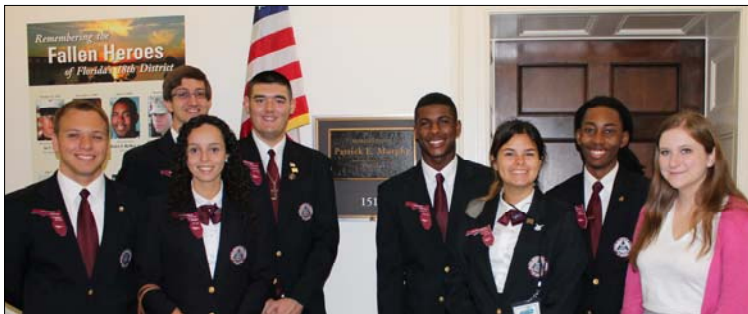
Our State Officers meet a staff member from Rep. Patrick Murphy's office serving district 18

It truly is spectacular to see HOSA in action from the very top, and even more so to know that it exists and functions all across the nation. More than ever, your State Officers are ready to lead with courage, and we are excited for what lies ahead. Be bold, be brave, be brilliant.