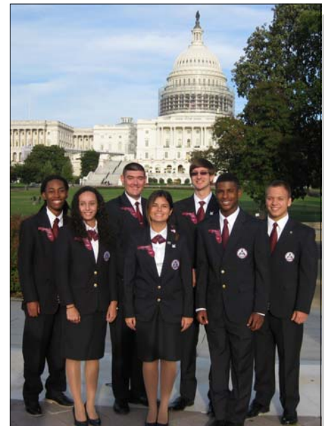
Our State Officers in front of the Capitol Building

The State Team made a variety of visits, including the Uniformed Services University of the Health Sciences (USUHS), the National Museum of American History, Florida House on Capitol Hill, and a number of sites on the Twilight Tour.