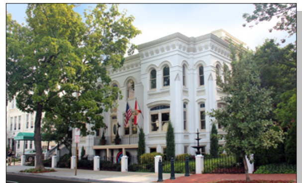
Florida House, Washington, D.C.