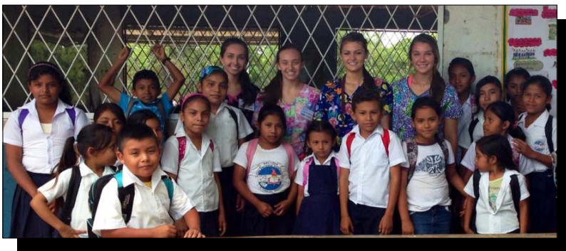
Shakopee HS volunteers

Vida Volunteer is providing a scholarship of approximately $1,870.00 (cost of the trip) to a high school senior or a postsecondary Florida HOSA member. More details to come soon on the Florida HOSA website. The winner will be announced at SLC 2015!