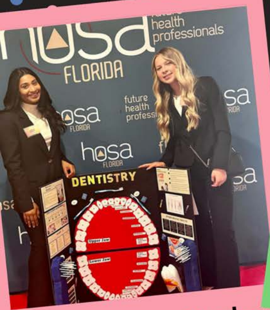
Health Career Display